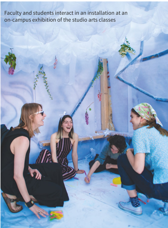
Faculty and students interact in an installation at an on-campus exhibition of the studio arts classes

Please see our website for details on these scholarships and others.